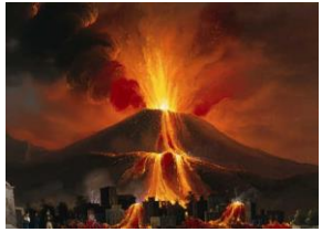
Mount Vesuvius in Pompeii